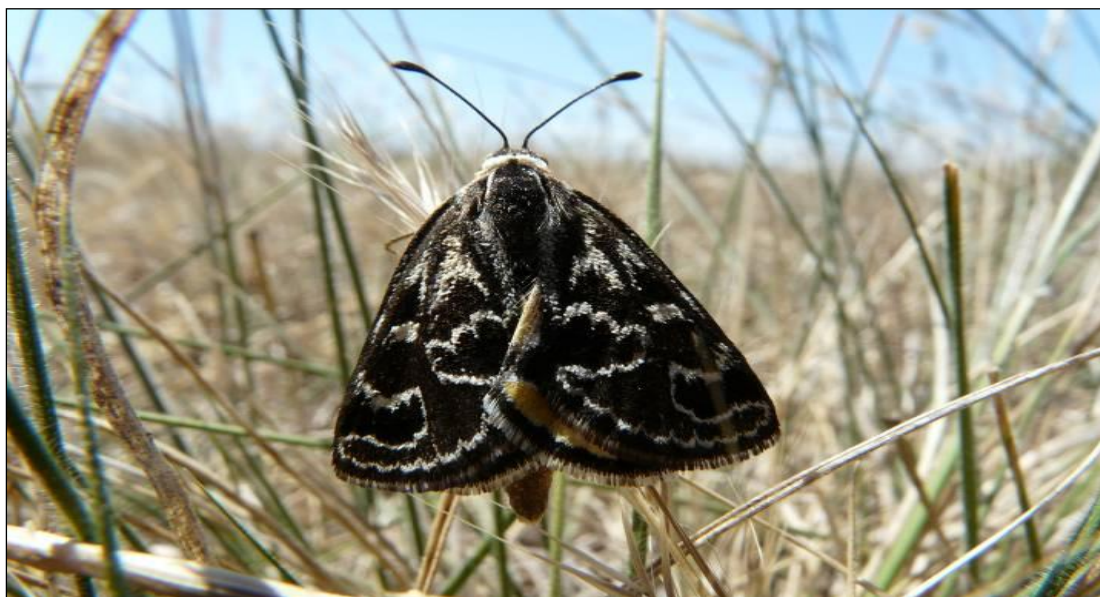
Figure 1: Male Golden Sun Moth

The small diurnal GSM belongs to the family Castiniidae . The females are semi-flightless and are relatively immobile. Dispersal appears to be low with a range of up to 100 metres (Cook and Edwards 1993). The forewings of the male are dark brown with grey scales and the hind wings are bronze-brown and black (Figure 1). The underside of the male is pale grey with brown patches. The forewings of the female are brown and grey and the hind wings are bright orange with black submarginal spots. The male has a wingspan of about 3.5 centimetres whilst the female is smaller with a wingspan of about 3 centimetres.